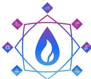
Research and Education Center RATIONAL SUBSOIL USE