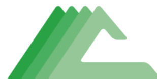
INTERNATIONAL SHOW CAVES ASSOCIATION