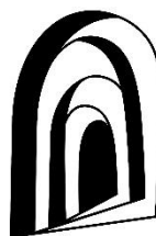
ЦЕНТР ИЗУЧЕНИЯ И ОХРАНЫ ПЕЩЕР